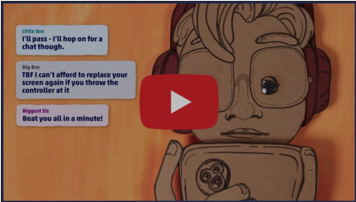
Our Connections Matter - brothers, sisters and sibling-like relationships video created by The Fostering Network and the Perth and Kinross Champions Board.